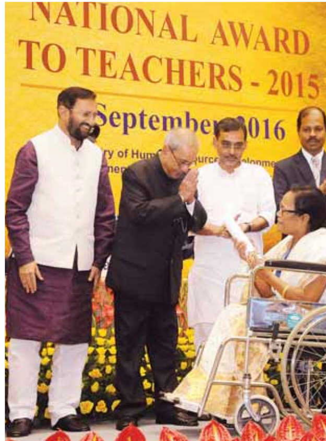
President Pranab Mukherjee honours a teacher as Union HRD Minister Prakash Javadekar and Mos for HRD, Upendra Kushwaha look on during the National Award to Teachers 2015 function on the occasion of Teacher’s Day in New Delhi on Monday

said he was the Visitor of 114 central institutions, including 30 NITs, 16 IITs, 45 universities, management institutions etc. There are 732 universities and 36,000 degree colleges in the country presently.